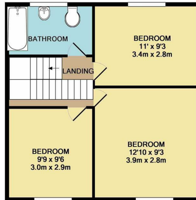
1ST FLOOR APPROX. FLOOR AREA 526 SQ.FT. (48.9 SQ.M.)

TOTAL APPROX. FLOOR AREA 1107 SQ.FT. (102.8 SQ.M.)